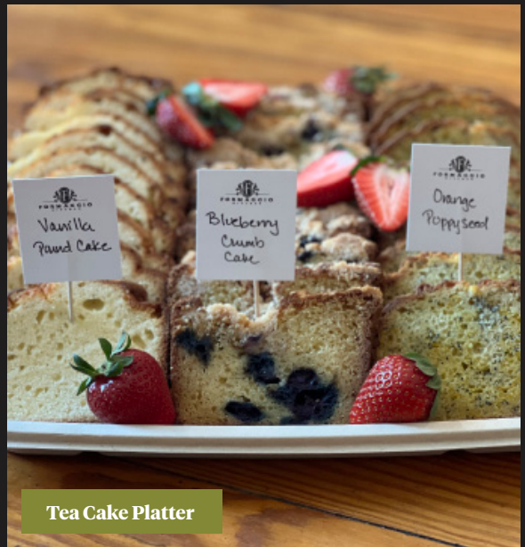
Tea Cake Platter