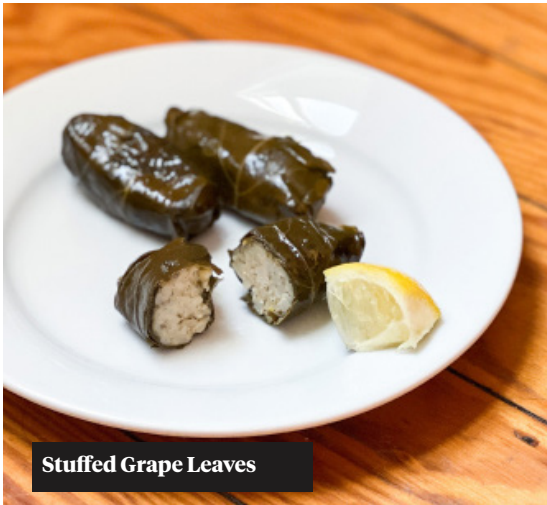
Stuffed Grape Leaves