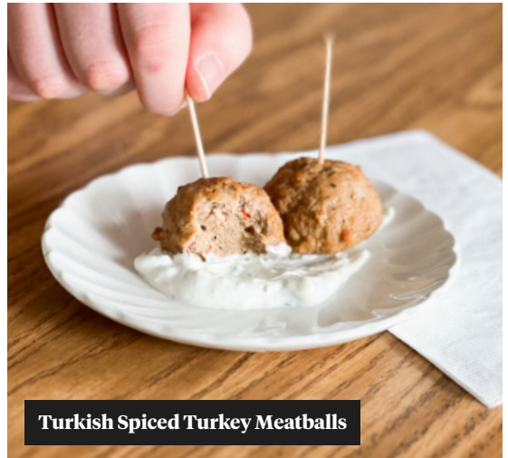
Turkish Spiced Turkey Meatballs