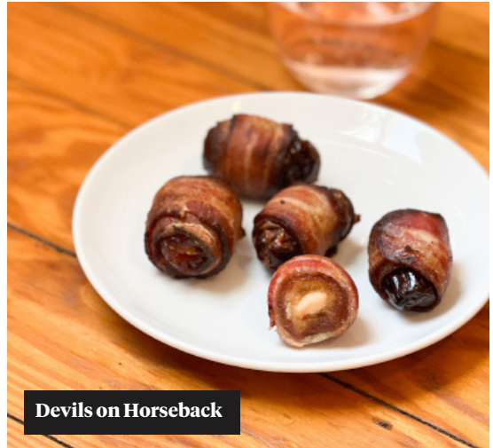
Devils on Horseback