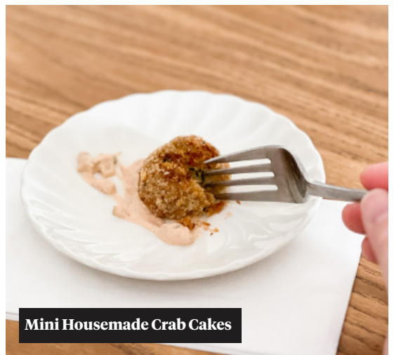
Mini Housemade Crab Cakes