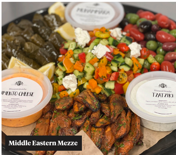
Middle Eastern Mezze