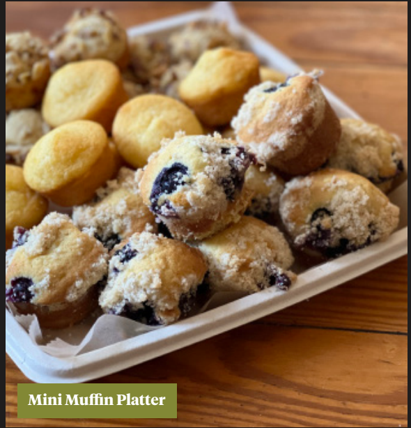
Mini Muffin Platter