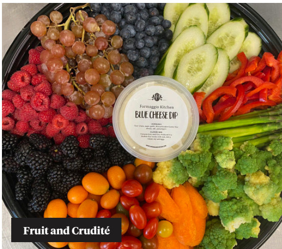
Fruit and Crudité