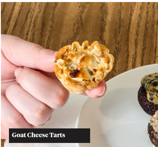
Goat Cheese Tarts